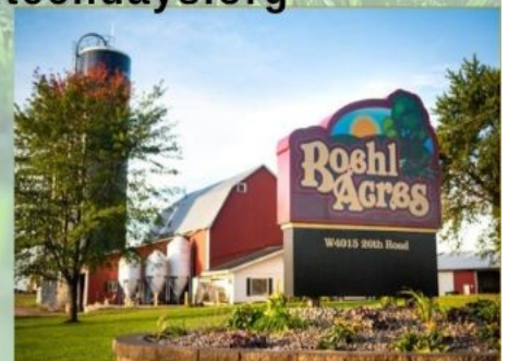
Roehl Acres W4015 26th Road Loyal, WI