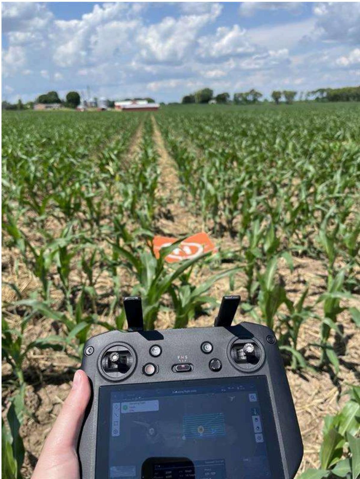
Drone flight in a corn field that had multiple cover crop species.